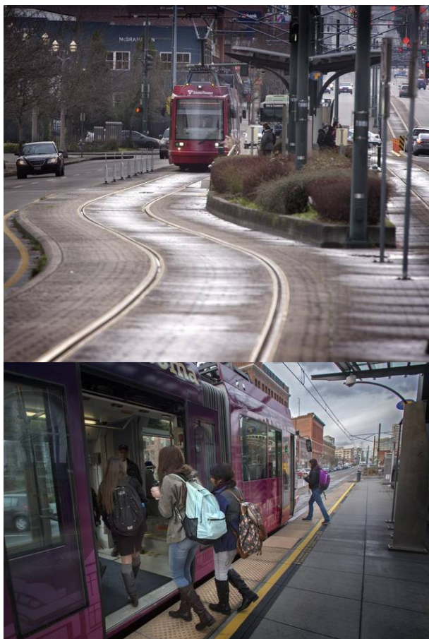
Link Light Rail train moves along Pacific Avenue in downtown Tacoma on Dec. 17.